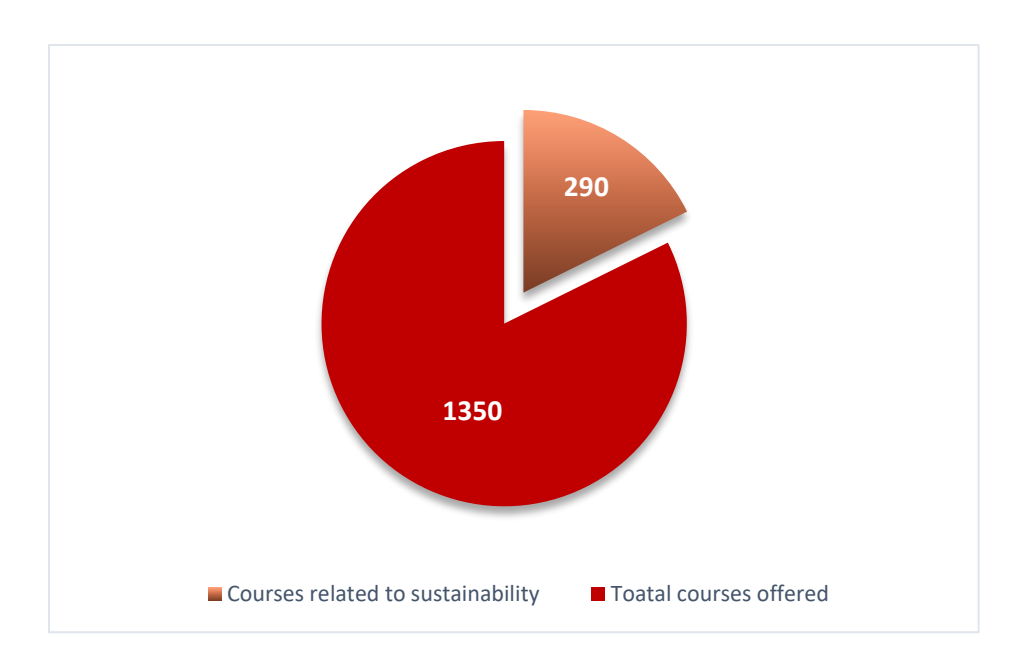
Figure 4.2 Ratio of sustainability courses versus total courses

In 2022-2023, courses related to sustainability and embedded in curricula were 290 courses, while total courses for all programs were 1350 courses. Consequently, the ratio of sustainability courses versus total courses was 21.48% as shown in Figure (4.2).